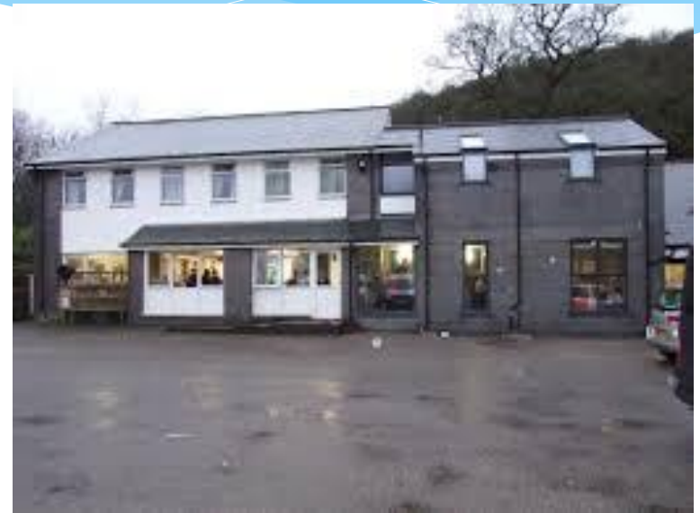
Rhos-y-gwaliau Outdoor Education Centre Bala, North Wales